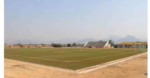
The artificial soccer pitch