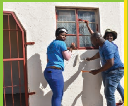
Officials from Corporate Services painting at Seboye