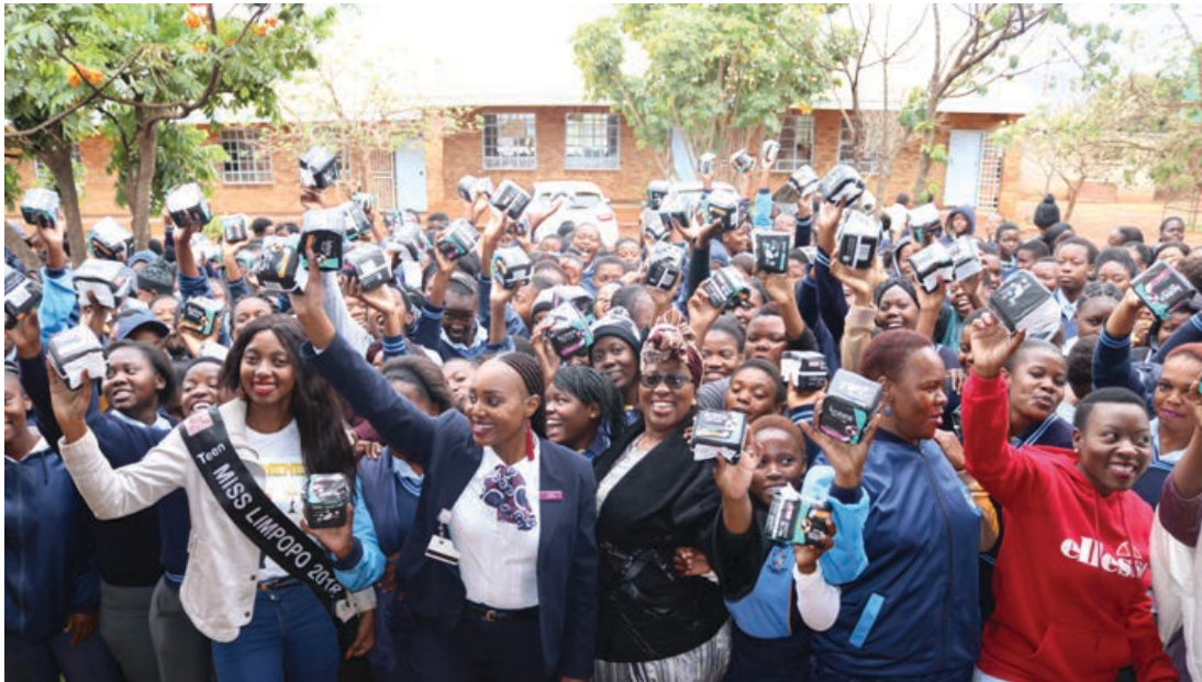
The First Lady with schoolgirls that received sanitary towels at Pheerehla Maake High School