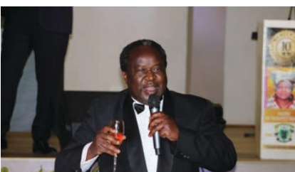
Finance Minister Tito Mboweni proposing a toast