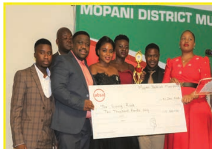
Executive Mayor Nkakareng Rakgoale with The Living Rock gospel music group