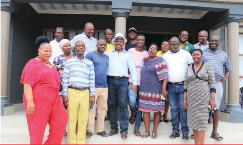
Executive Mayor Nkakareng Rakgoale, hands over a cheque, a trophy and certificate to King Monada

Local and well known artist King Monada was honoured by the Mayor, Speaker and Chief whip of the Greater Tzaneen municipality on the 14th of December 2018 at Mokgoloboto village. The visit was meant to congratulate him for putting Tzaneen on the map. "We are very proud of you man, who could have thought a young boy from a rural village of Mokgoloboto will one day be seen on TV and heard on national radios stations? Be a role model to your