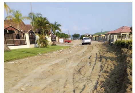
Work to upgrade some streets has begun in Nkowankowa

The road has been a cause for concern for many years, residents complained about the street which made it impossible for motorists to drive through especially when it rains. Makasana Construction is responsible for the construction of the road which is budgeted for 8.7 Million.