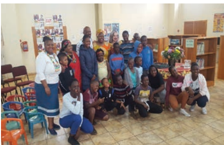
Storytellers, children and library staff members at Mulati Library during the storytelling event.

The Greater Tzaneen Municipality hosted a story-telling session for children at Mulati Library in Mulati village on Saturday 08 September 2018. The event was attended by story-tellers from India, Swaziland, Mpumalanga and Limpopo who entertained children throughout the day. The event was a joint initiative between UNISA and the GTM.