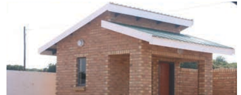
The guard room