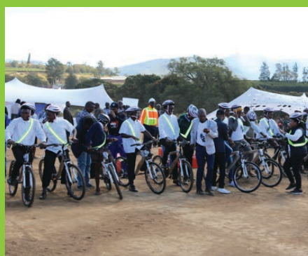
Recipients of bicycle at Lephephane Village