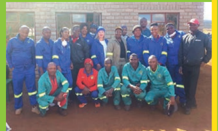
Community Services officials after cleaning Angel's Home.