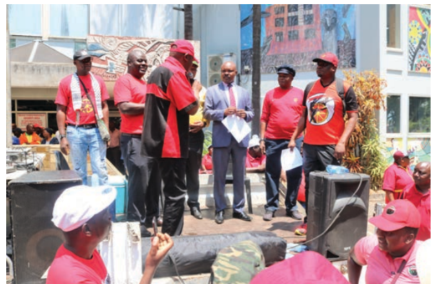
Cosatu brought its provincial march to the doors of Greater Tzaneen Municipality on 15 October 2018