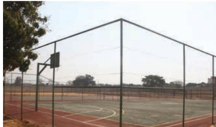
Tennis court and basketball court