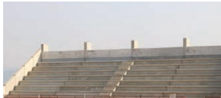
The new grandstand takes 500 people