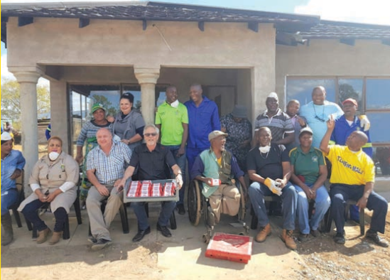
PED officials and representatives of the business hammbur painted this house in Julesburg