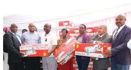
Deputy Minister for Small Business Development Cassel Mathale with some of the beneficiaries

to support you, we want to support you, we want to travel this journey with you and ensure that your businesses are registered. It only takes 10-15 minutes to register. LEDA doors are always open and waiting for you. We are going to do monitoring to check if the equipment distributed today are used wisely and if the businesses are operational".