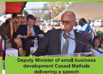
Deputy Minister of small business development Cassel Mathale delivering a speech