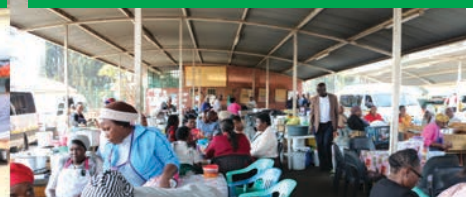
Councillors enjoying lunch at the Tzaneen Crossing Taxi Rank

GTM councilors have not only been preaching small business support, but they have also been supporting them practically. After council sitting on the 31st of July 2018 GTM Councillors proceeded to the Tzaneen Crossing taxi rank next to for lunch. About 15 food stalls were occupied with Councillors including the Mayor, the Chief Whip, EXCO Members and PR councillors enjoying their lunch. The councilors feasted on pap, chicken, beef, fish, mogodu, morogo and cabbage.