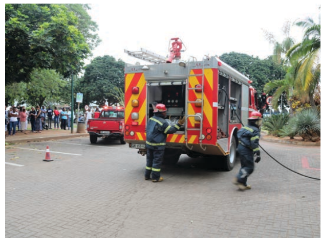
The municipality conducted a fire drill on 23 November 2018 to test its readiness in an event the building was gutted. The operation involved the fire department, disaster management, traffic as well as SAPS.