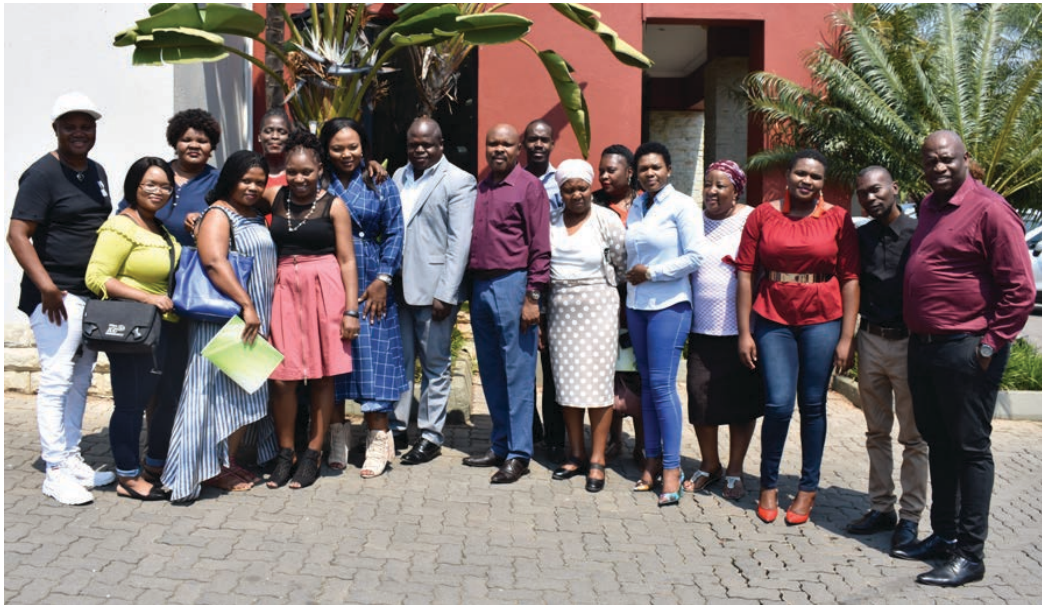
Mayor Maripe Mangena treated members of the media to a scrumptious breakfast at Crawdaddy's Restaurant in Tzaneen on 19 September 2018 as part of his regular interaction with municipal stakeholders.