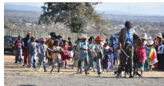
A group of dancers entertained the crowd

Xitsavi Youth Centre was established in 2009 by Valoyi tribal authority with the aim of enhancing social and economic well-being of poor communities in particular the youth of Nwamitwa communities. The centre provides various training skills and has a food security programme that includes a vegetable garden. One of