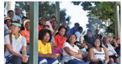
GTM women pay attention to one of the speakers