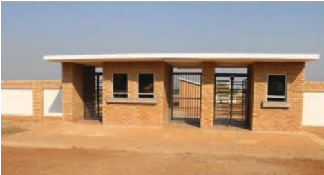
Entrance with ticket office