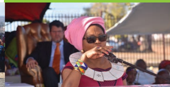
Speaker of Parliament Baleka Mbete gave the keynote address