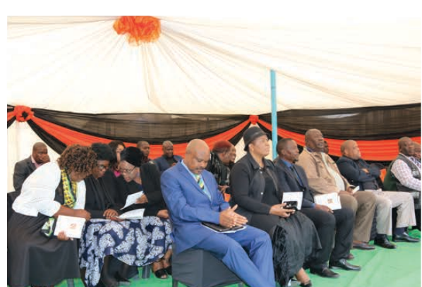
Mayor Maripe Mangena and Mopani District Executive Mayor attends the funeral of a five year old boy who fell into a borehole pipe in Joppie Village. The body of the child was recovered two days later after a rescue operation led by the Mopani District Municipality