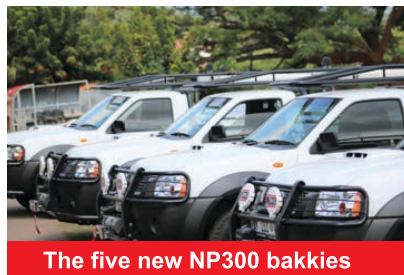
The five new NP300 bakkies

The handover ceremony attended by Executive committee members and the municipality's top management.