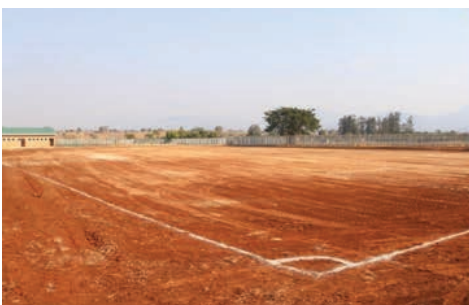
The facility also has a gravel soccer field