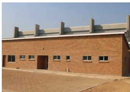
Ablution facilities and dressing rooms