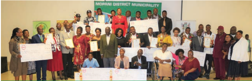
The Stars of Mopani with their Mayors and Traditional Leaders