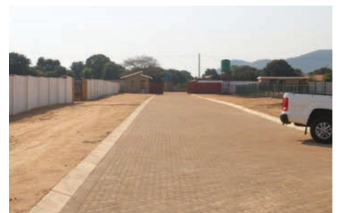
The facility is also paved

In an earlier edition of the GTM Bulletin Matlala said that project will encompass the construction of a palisade fence covering 75 000 square meters and a concrete pavilion to accommodate at least 500 spectators. The scope of work also incorporated the relocation of the “existing” artificial pitch which was installed as part of the 2010 FIFA world cup legacy project which saw similar artificial pitches installed in all 52 SAFA regions. With the upgrade the stadium now boast a ticket booth and an entrance with turnstiles to help with crowd control especially in events with entrance fees. Also in the stadium precinct are courts for netball, volleyball and basket ball. With the area facing water scarcity, a water storage tank with a water pump has been installed to