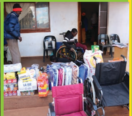
CFO and her officials donated wheelchairs, blankets and groceries.