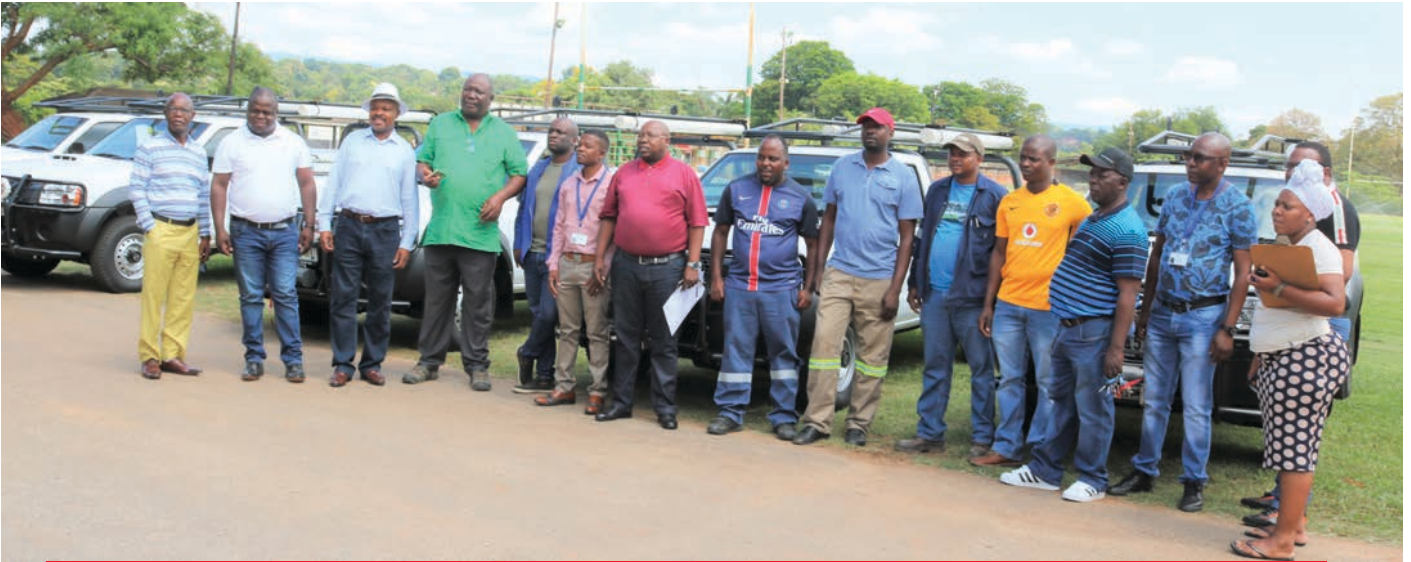
GTM officials led by the Mayor during the official handover of new LDVs for electricians

GTM electricians now have new wheels, the electricians who have been struggling with their old vehicles received their brand new vehicles from Mayor Maripe Mangena on the 14th of December 2018 at Letaba Show Grounds.