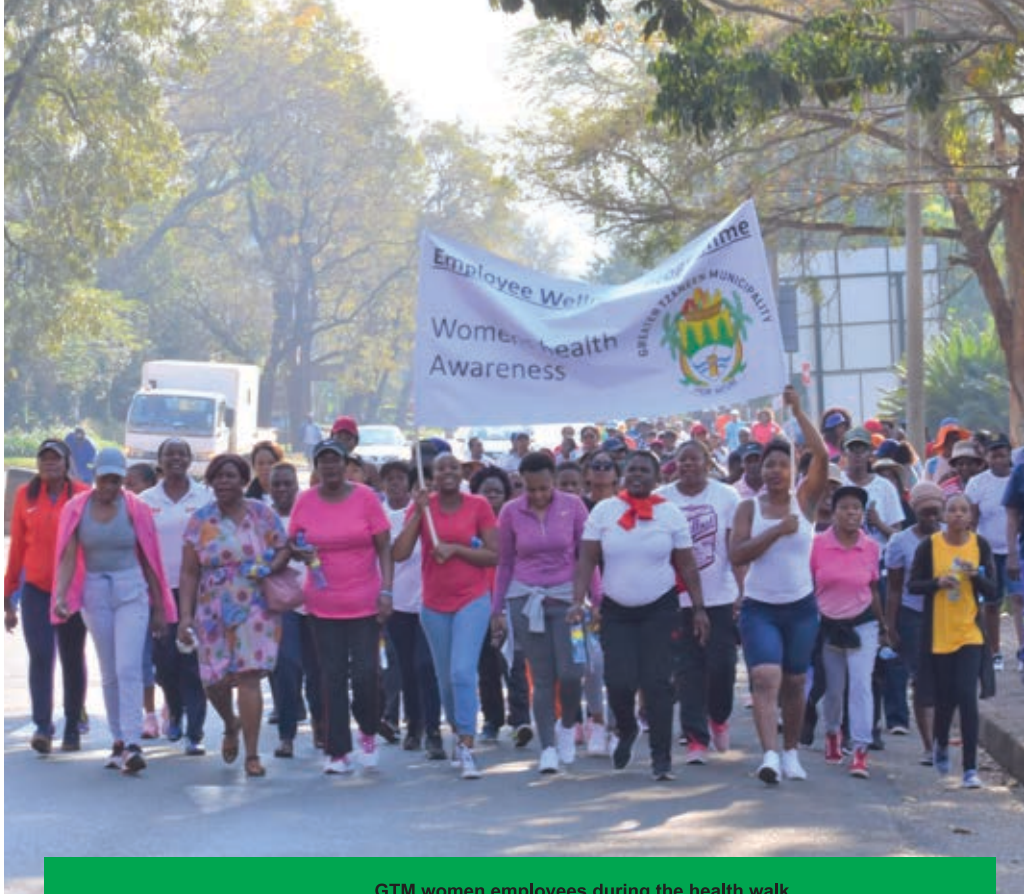
GTM women employees during the health walk

Medical doctor advice GTM women to go for regular check-ups for early detection of disease while a business woman urge them to fully exploit their talents.