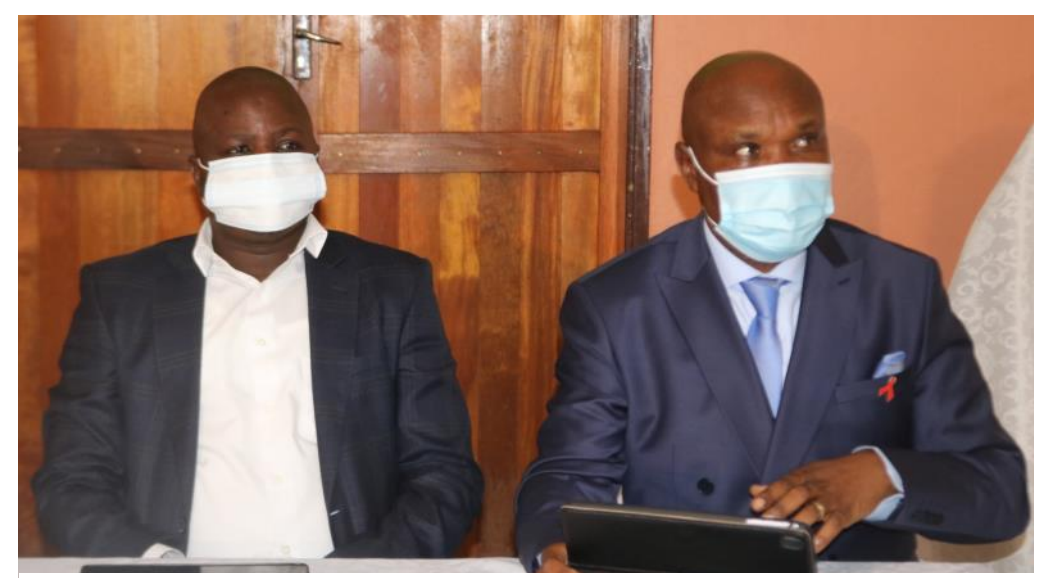
The Executive Mayor of Mopani District Municipality, Councillor Pule Shayi and Mayor Maripe Mangena at GTM SOMA.