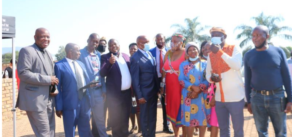
GTM Mayor Maripe Mangena flanked by GTM Councilors at the State of the Municipal Address