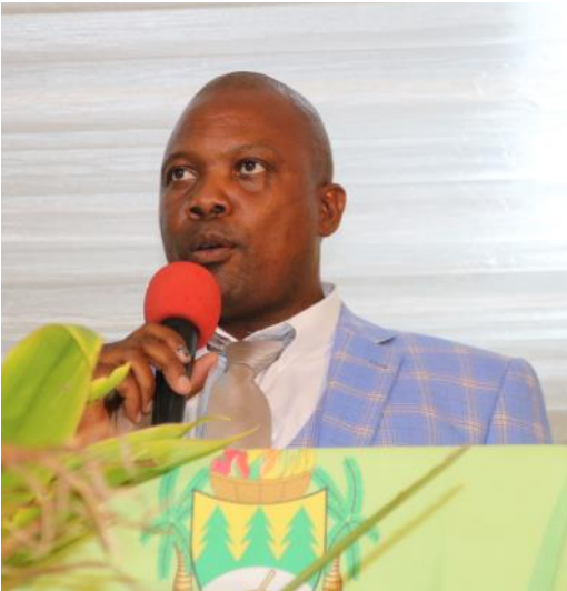
sponding to the Mayor 'speech.