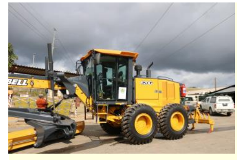
The GTM faces a huge road maintenance backlog mainly caused by heavy rainfall and limited resources. With a growing demand to service

gravel roads especially in rural areas, the municipality struggles to meet the demand but with a new grader to add to the existing fleet of graders the service is more likely to improve. The municipality currently has four graders. During the handover on 21 April 2021, Mayor Maripe Mangena said "As the GTM we decided to buy this grader which must be able to assist our rural communities". Our municipality is largely rural and when you go there to conduct imbizos or public participation people complain