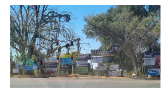
The area opposite the main entrance to Tzaneen Lifestyle Center before the clean-up and the area after the clean-up (below)

For further enquiries contact Maureen Ramabulana 015 307 8081 or Freddy Rammalo at 015 307 8290/082 809 0454 or Freddy.rammalo@tzaneen.gov.za.