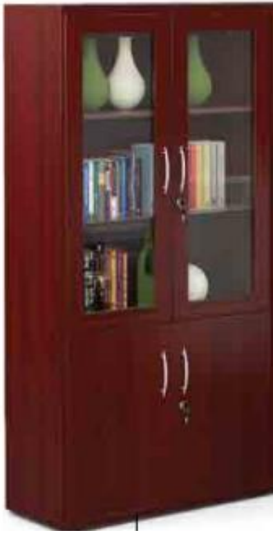
1 X Executive Wall Unit 900x450x2000h-Full Glass Doors in Mahogany Veneer