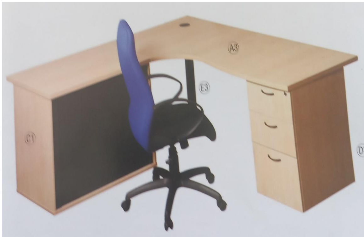
2 x Table Mahogany Melamine 22mm Top