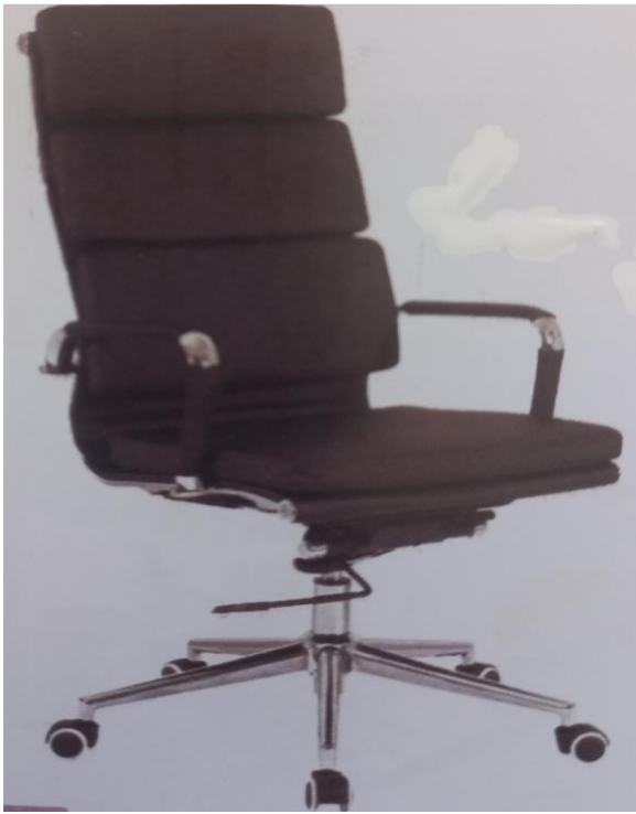
2x Black PU cushioned seat & back (High back chair)